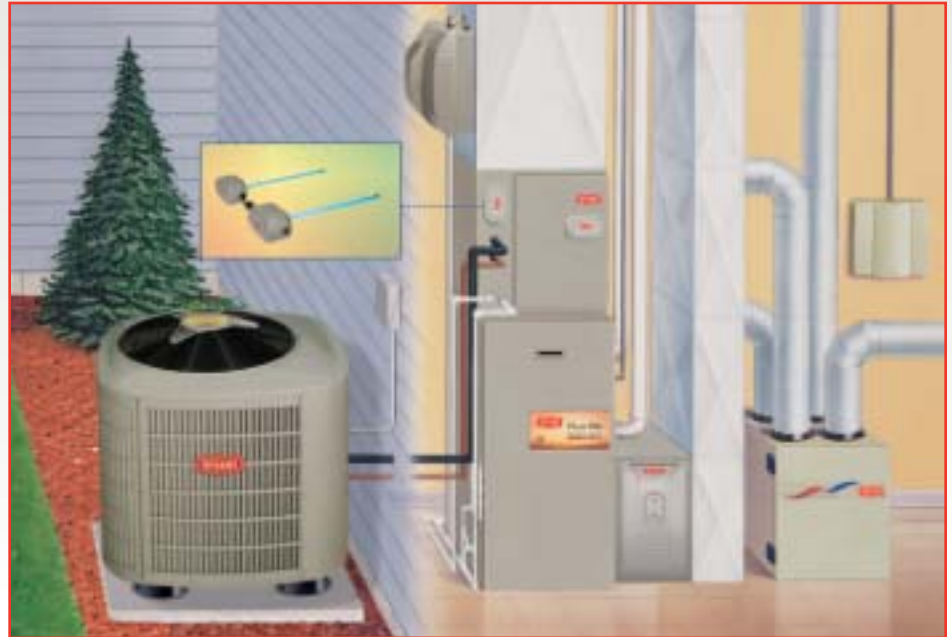
HYBRID HEAT™ Deluxe Heat Pump and Deluxe Gas Furnace System

Model 355CAV shown with optional Bryant High-Efficiency Media Filter